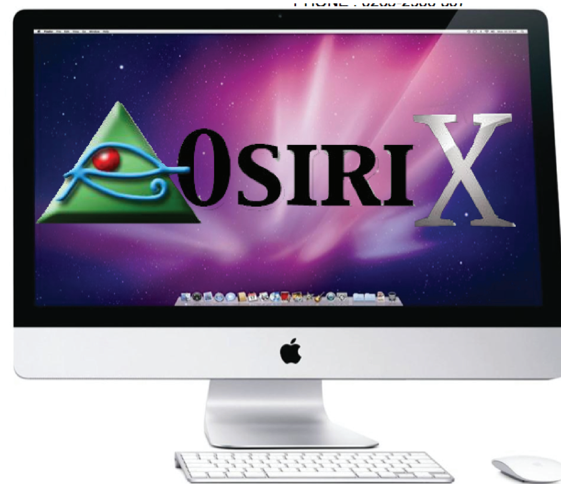
Apple Based CT Workstations