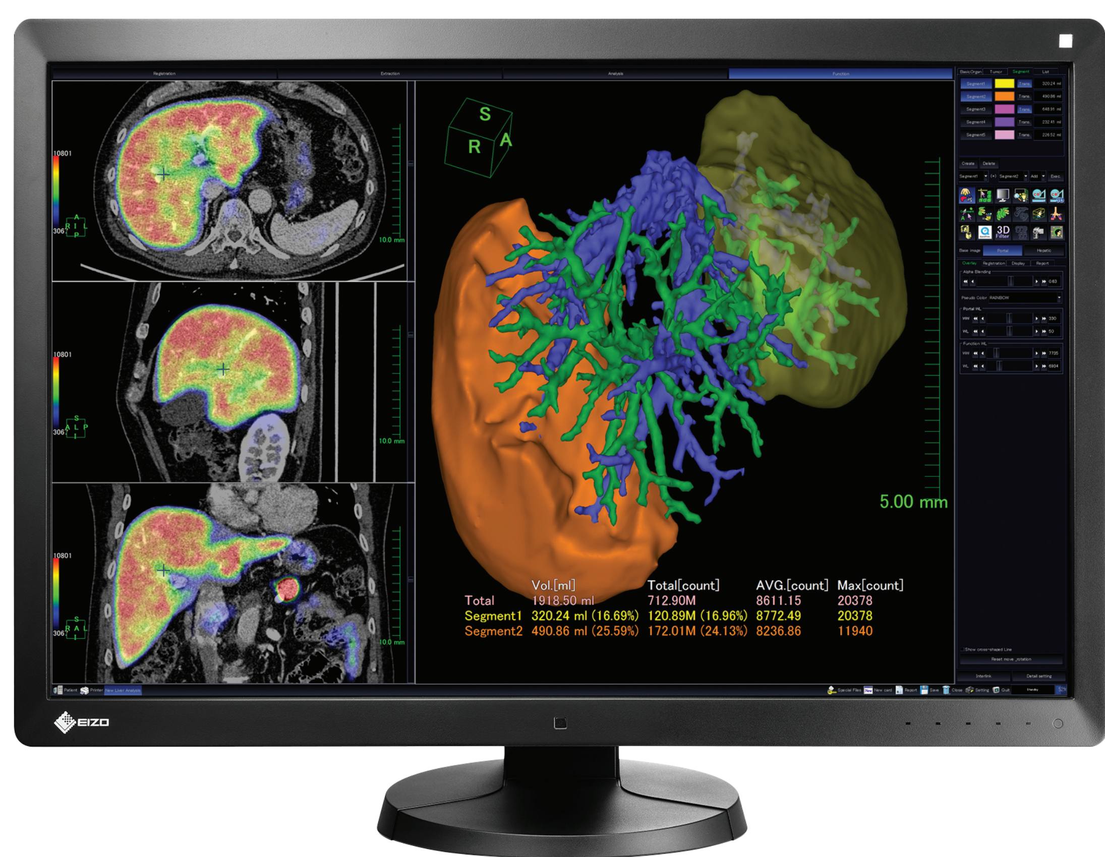
Medical Grade Monitors